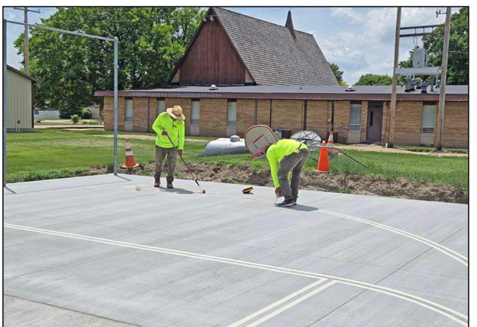
After power washing and sanding the new cement pad at Carroll Street Courts, Pro Track & Tennis employees began the process of striping the south half basketball court with a brick red color last Wednesday, June 3. When work is complete, stripes will also be painted for a tennis court and one pickleball court.