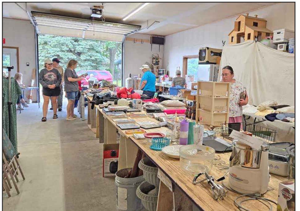
Bargain hunters enter garage sale #12 on Saturday morning during Chamber's city-wide garage sales. There was a good rush in the morning hours at 20 sales located all over town. The Goodwill truck pulled into town on Monday for a convenient way to donate items that didn't sell.