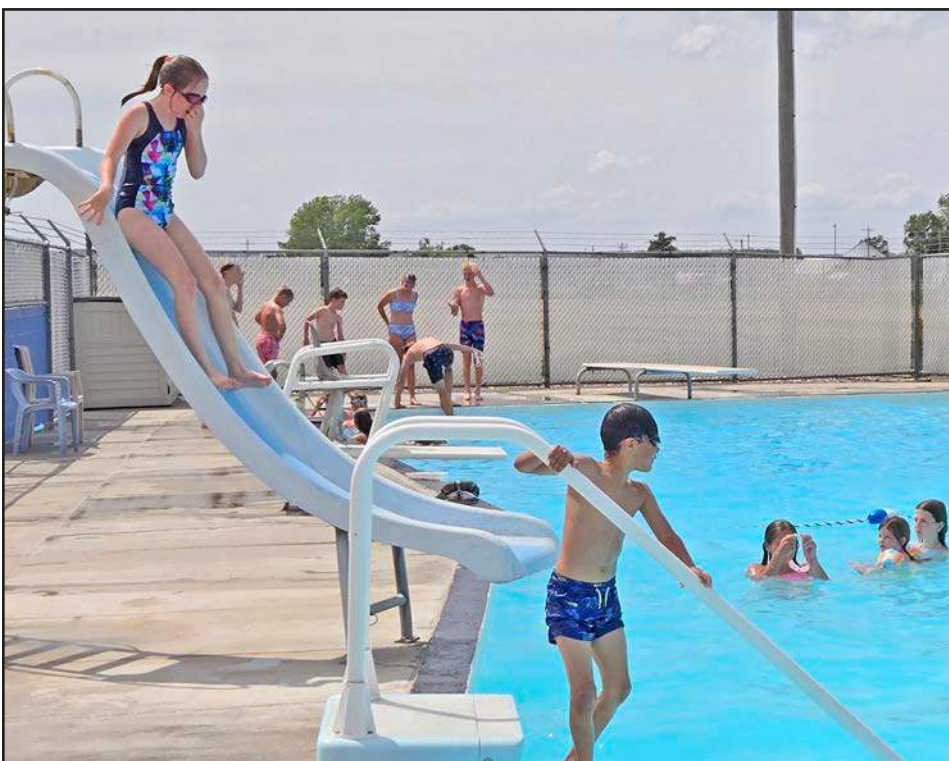
(Above & Below) Kids were officially in swim mode last week with the opening of the Arnold pool.