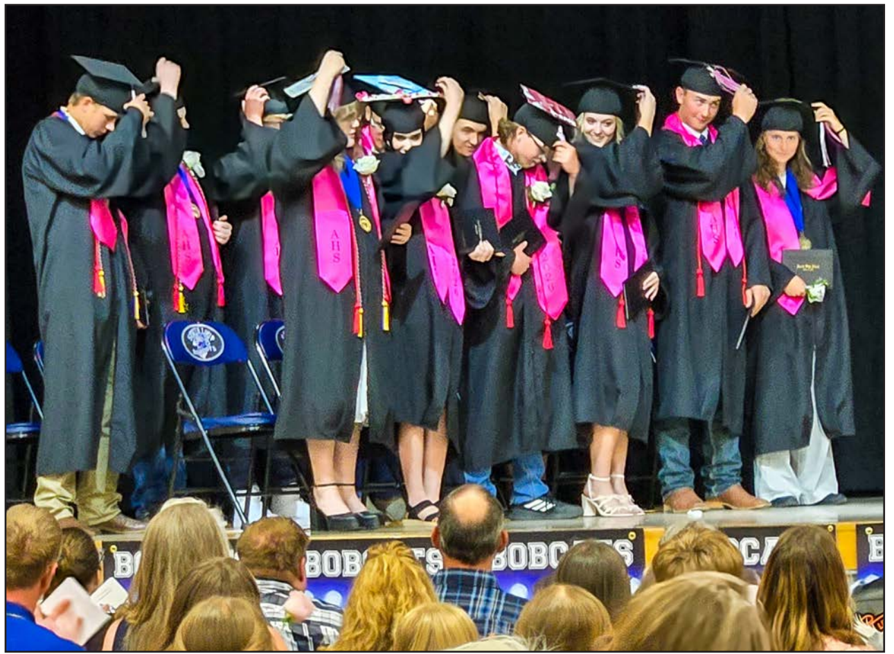
From students to graduates, members of the Class of 2026 turn their tassels at Saturday’s commencement exercises.