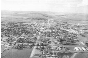
Serving the South Loup River Valley