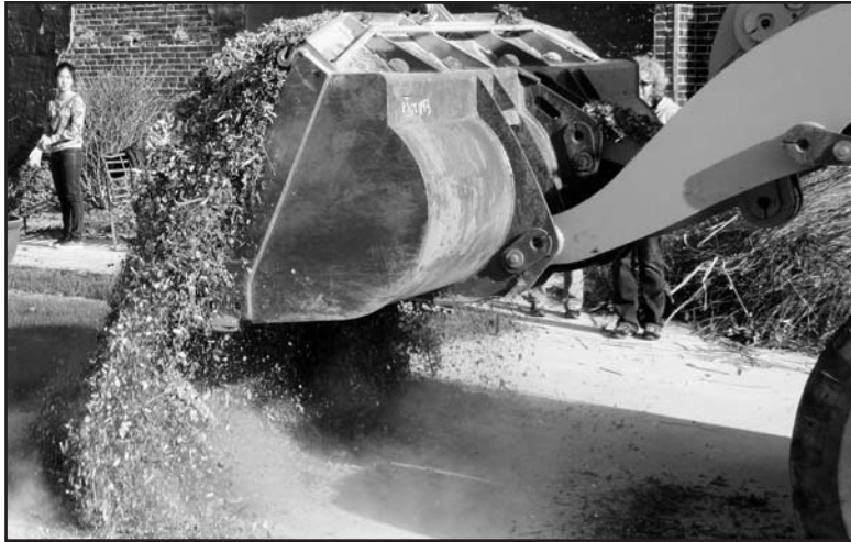
A load of mulch is dumped at Koubek Gardens for a landscaping crew that was working there.