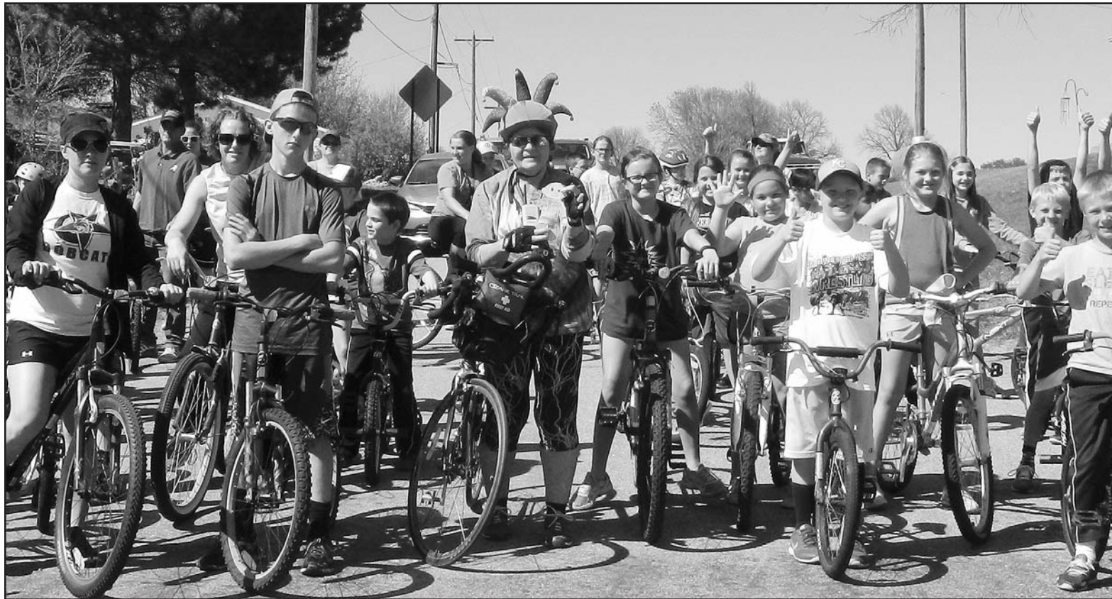
A large group of St. Jude's Bike-a-Thon riders get set to ride a 10-mile course to raise money for children's research.