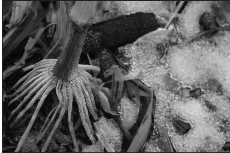
Toni Oberg's photo of a corn cob frozen to the ground after harvest was a Gold Key winner in the Scholastic Art Show.

cally considered for national-level recognition.