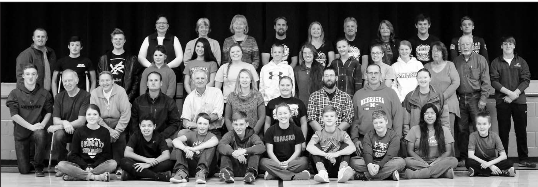
Mentors and mentees of the Arnold TeamMates organization are pictured with members of the Devil's Den Motorcycle organization after receiving a $2,000.00 donation raised from last summer's motorcycle rally.

The Sentinel is requesting an early deadline of Friday, December 23, at noon for all news and advertising for the December 29 issue so that employees can take an extended break. Any items turned in after this Friday at noon will be included in the January 5 issue. Please use the slot in the office door and items will be retrieved. Have a Merry Christmas, everyone!