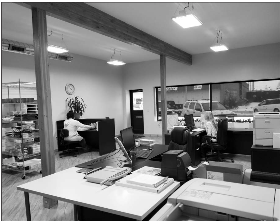
Staff at The Arnold Sentinel moved back into the completely renovated 1930s building in May, after working out of a temporary office in Hotel Custer since January. Three building renovations started in 2017 on Main Street.