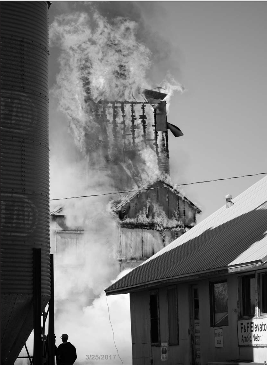
The west grain elevator on the east edge of town goes up in flames last Saturday morning during a controlled burn to destroy the aging structure.

Fourteen Arnold volunteer firemen and EMTs received some valuable training last Saturday, as the old west grain elevator on the east side of town was burned to the ground in a controlled burn.